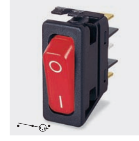
o C6003AL ---