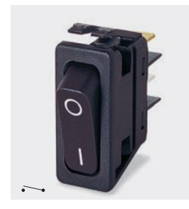
6 C6000AL ---